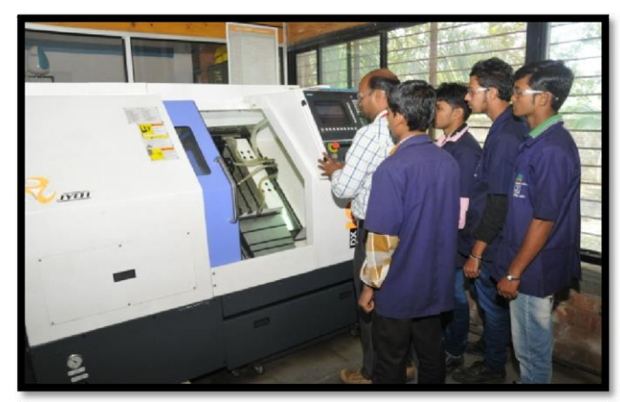
CNC Operator Turning

Government of India initiated Short Term Courses (STC) in for imparting Skills in various Vocational Trades to meet in skilled manpower requirements for Technology & industrial growth of the country. About 70% of the training period is allocated to Practical Training.