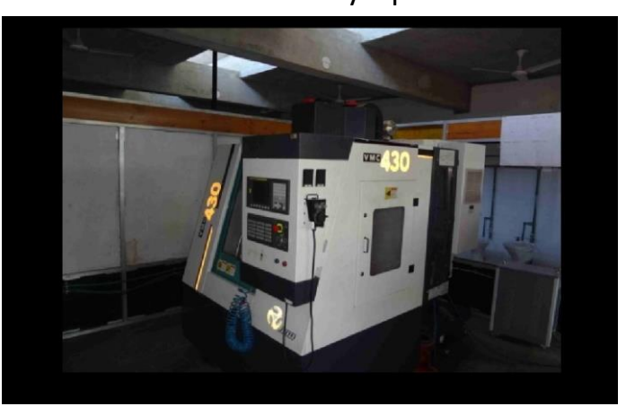
CNC Operator – Vertical Machining