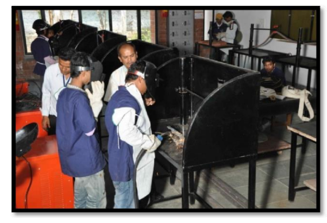
Tungsten Inert Gas Welder (GTAW) Centre