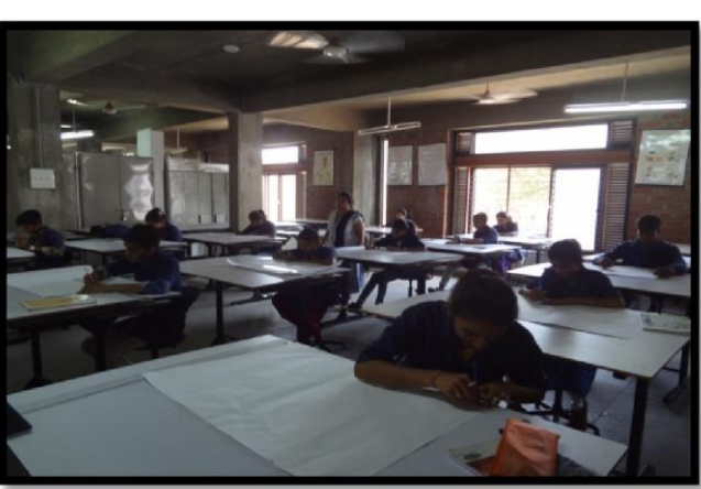
Draughtsperson (Interior Design)