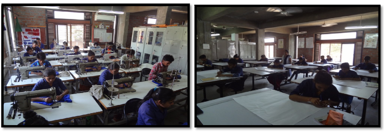
Industrial Sewing Machine Operations