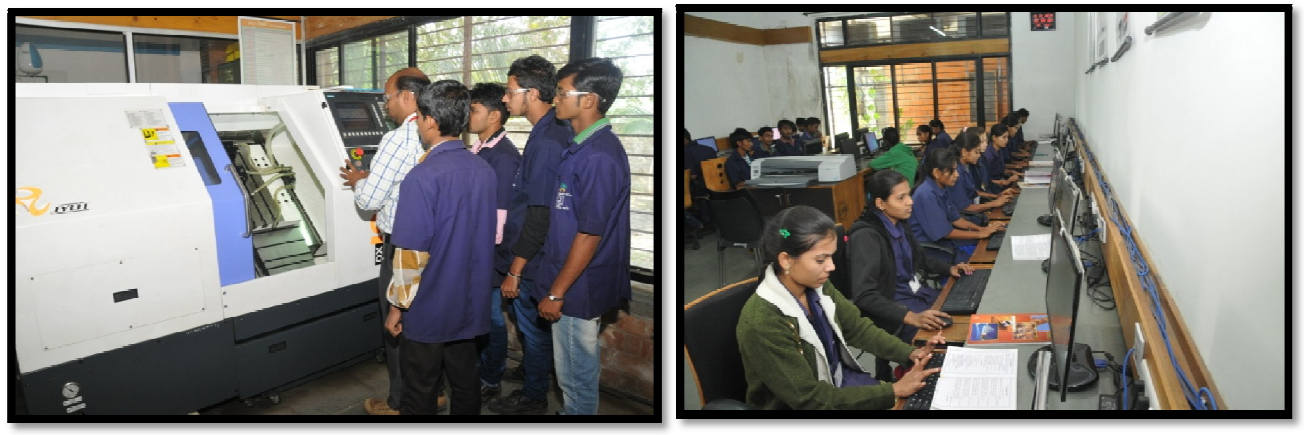
CNC Turning Operator

Government of India initiated Modular Employable Skills (MES) in for imparting Skills in various Vocational Trades to meet in skilled manpower requirements for Technology & industrial growth of the country. About 70% of the training period is allocated to Practical Training.