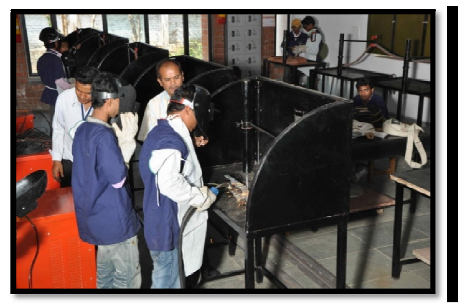
TIG & MIG Welder