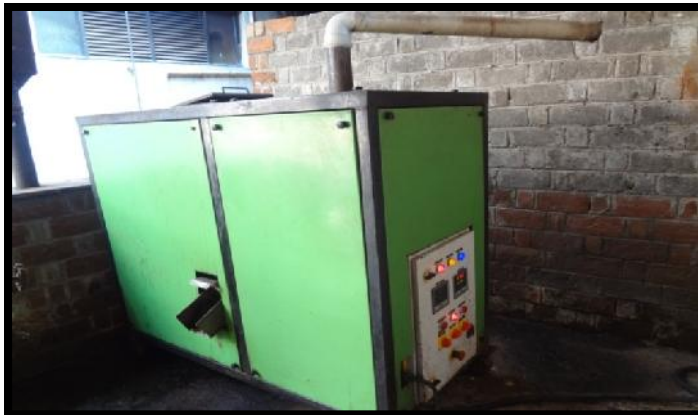
30 Kg per Day Composting Machine