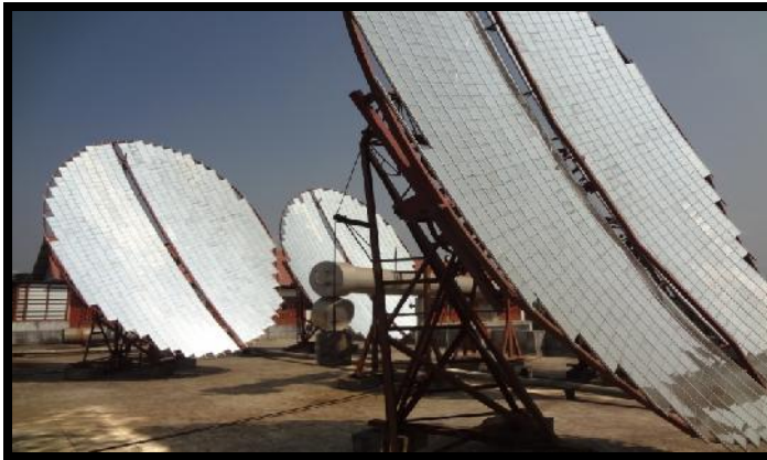
Solar Steam Cooking System