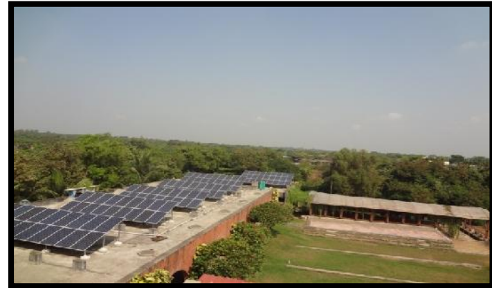
40KW Solar Power Plant