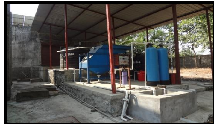
20 M 3 per Day Sewage Treatment Plant